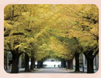
Ginkgo trees in the fall

For further inquiries, please visit our website: http://www.s.u-tokyo.ac.jp/GSC/